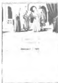
1977 Memo Moderne