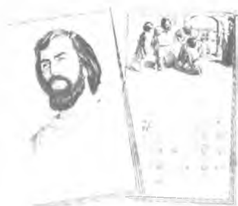
1977 Scripture Text