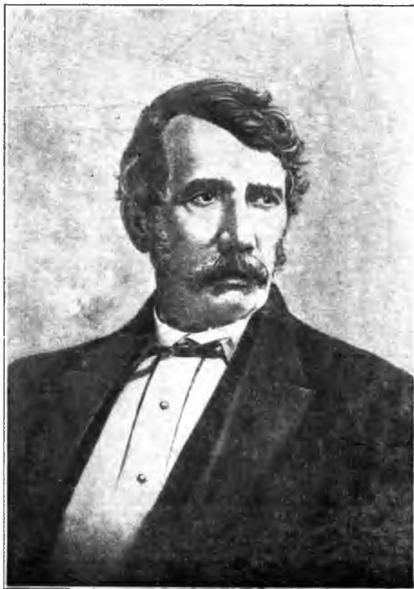
DAVID LIVINGSTONE Preacher - Missionary - Explorer. 1813 - 1873.

NAZARENE PUBLISHING HOUSE, KANSAS CITY, MO.