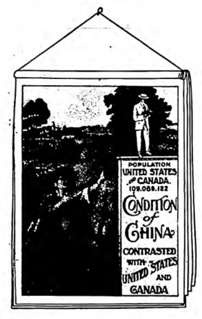
28 x 36 Inches