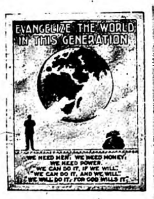
ONE OF THE CARDS 3% x 4% inches

Perhaps an adult class would be willing to donate the missionary chart. If not, a special offering could be taken. Whatever the method of raising the money, be sure that your Sunday school gets a chart and plenty of the cards.