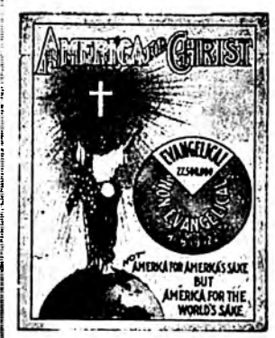
ONE OF THE CARDS 3% x 4% inches