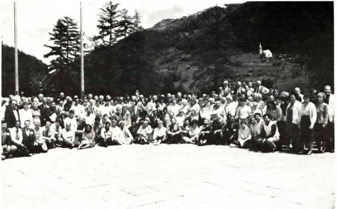
The group of around 230 people who attended the regional conference from the 19 districts of Eurasia