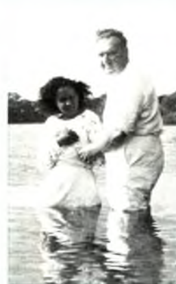
Baptizing in the Tweed River