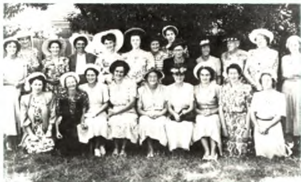
First NWMS delegates, 1950