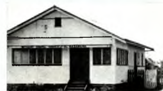
Bethany Chapel, located at Parry's Estate