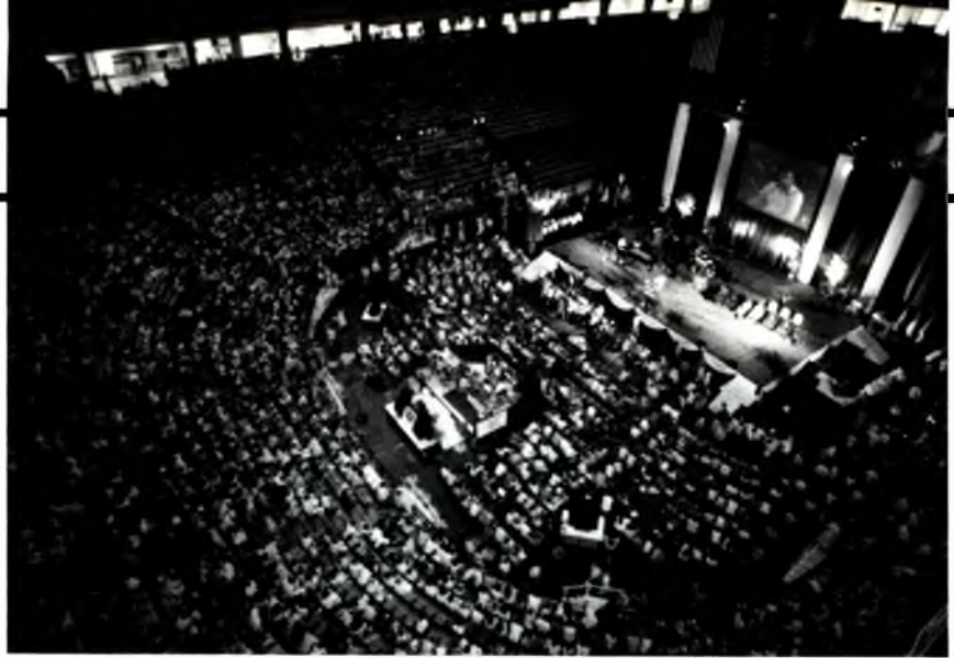
One of the indoor sessions at NYC '87