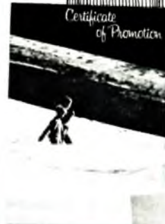
CT-49024 Children (6-8)