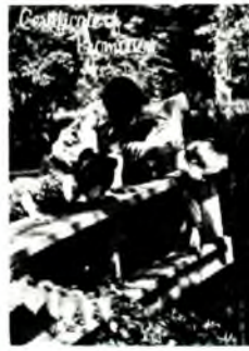
CT-49016 Kindergarten (multiracial)