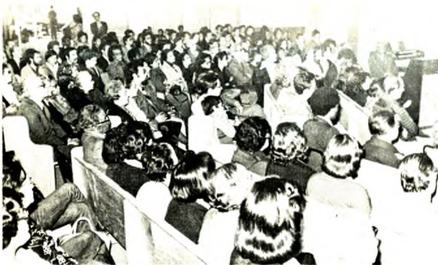
Partial view of those in attendance at Lisbon, Portugal, church on a week-night during "Northwesterners" visit.