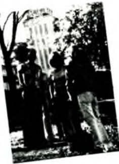
CT-49059 Youth (12-14)