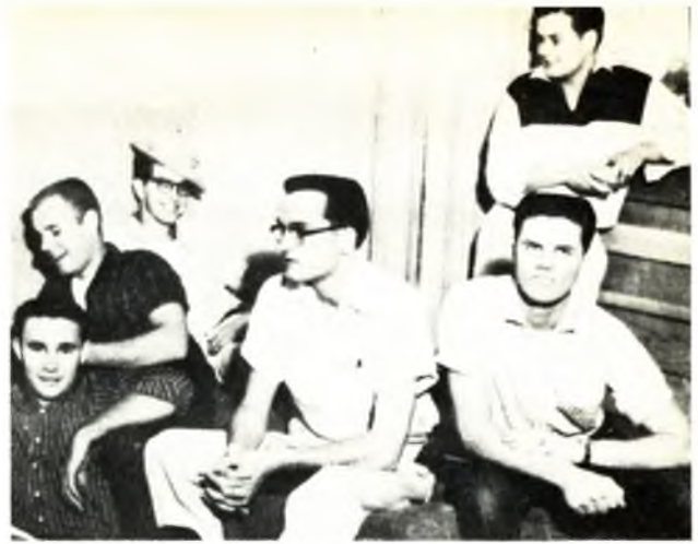
Living in a dormitory is one of the unforgettable experiences of college life . . . as it was in 1957 at Pasadena College.

I thought to myself, "Thank You, Lord, for helping