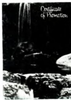
CT-49067 Youth (15-18)