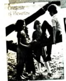
CT-49040 Children (6-11) multiracial