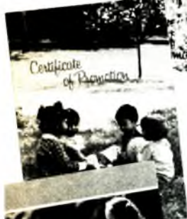
CT-48990 Nursery (multiracial)