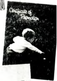
CT-49075 Department to Department