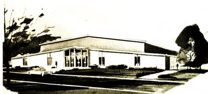
Architect's plan for Trevecca gym

The building features a regulation-size gymnasium with a seating capacity of 2,000, a regulation-size swimming pool, and recreation areas for both faculty and students. The ground level houses two classrooms, a rifle range, and two handball courts.