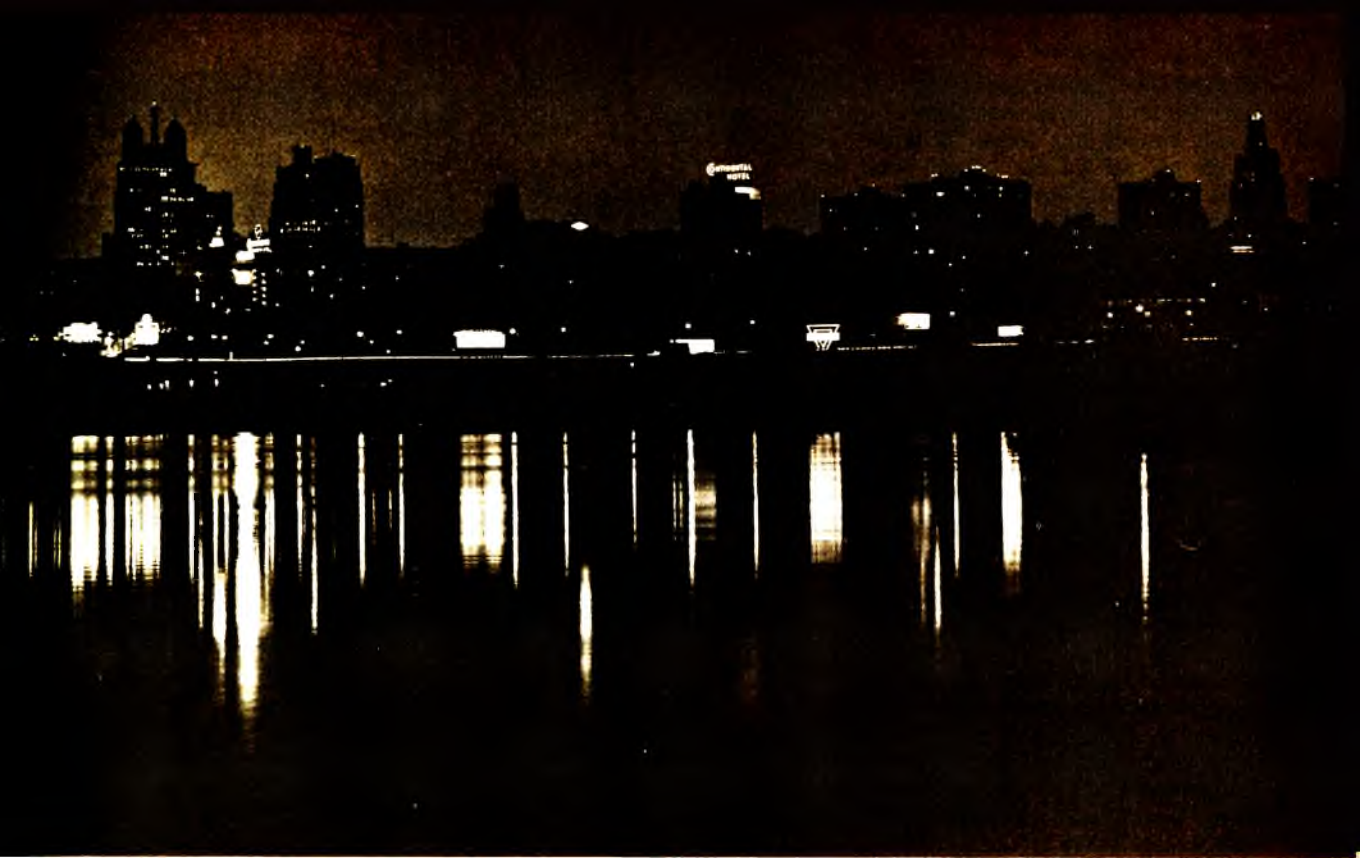
Kansas City at night